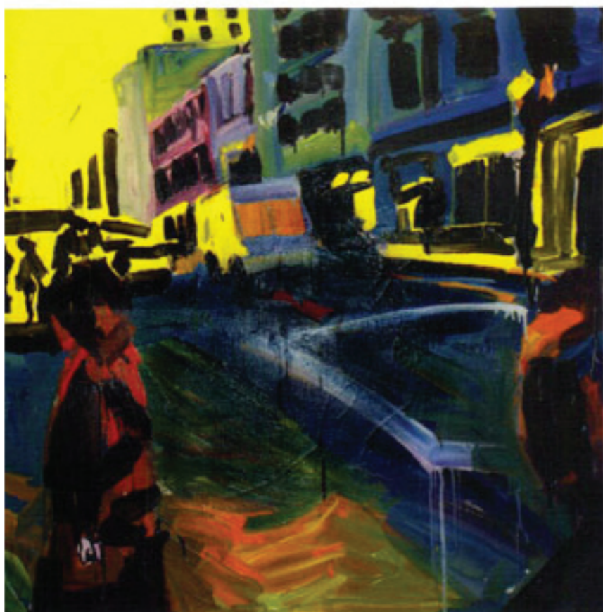
GOLDEN GLOW, 1998 Acrylic on canvas, 48 1/8 x 48 1/8 in. (122 x 122 cm) Courtesy of the artist, New York City, and Galerie Barbara von Stechow, Frankfurt, Germany