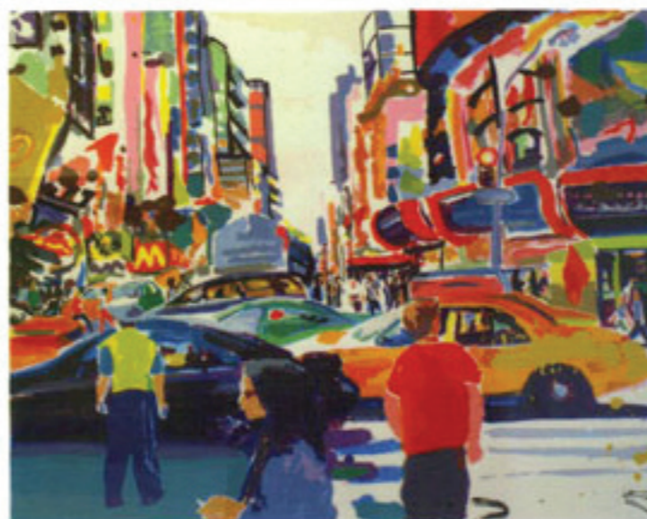
FROM A 42ND STREET CORNER, 2006 Silkscreen, 35 7/8 x 41 3/4 in. (90 x 106 cm) Courtesy of the artist, New York City, and Galerie Barbara von Stechow, Frankfurt, Germany